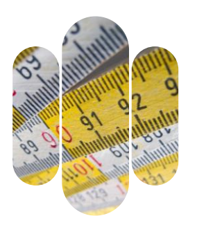
Low disclosure Self-reporting Distrust & disclosure Senior buy-in